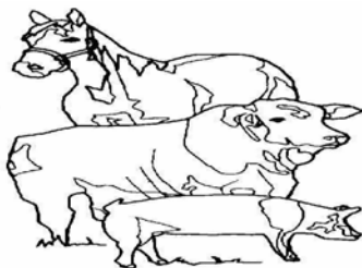
County Spring Livestock Show February 18-21, 2006

Tuesday, Feb. 21 9:00 a.m. - Judging of Beef Division, starting with Breeding Heifers.